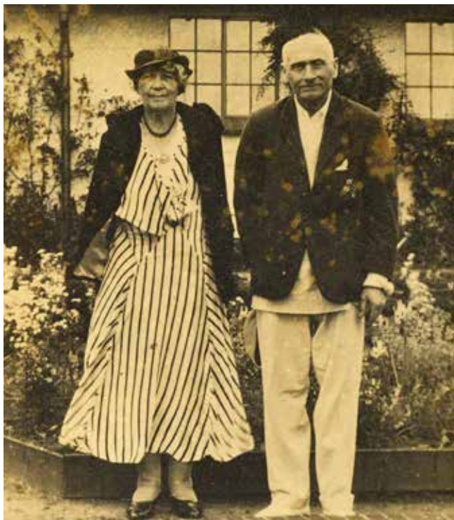
EMMELINE AND FREDERICK PETHICK LAWRENCE

In 1923 Frederick entered the Commons and later served in the Treasury before moving to the Lords in 1945. He remained committed to feminist causes, notably equal pay.