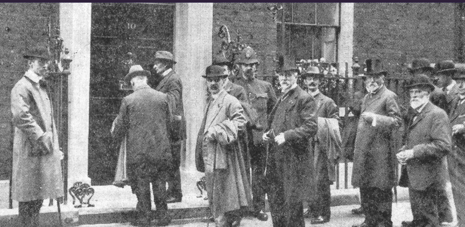
NORTHERN MEN'S FEDERATION DEPUTATION IN DOWNING STREET, JULY 1913