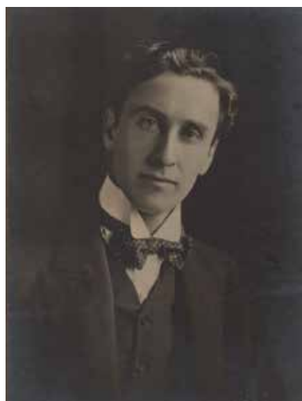
VICTOR ALEXANDER GEORGE ROBERT BULWER-LYTTON, 2ND EARL OF LYTTON, C.1911

Between 1910 and 1912 an all-party Conciliation Committee, chaired by Lord Lytton sponsored a series of Bills aiming to secure a limited measure of women's suffrage. Each attempt ultimately failed. Some blamed the suffragettes, others held the Government equally culpable.