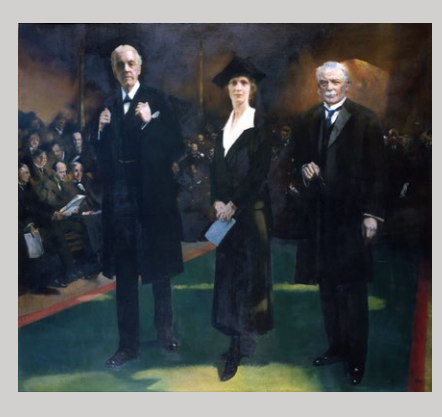
Introduction of Lady Astor as the first woman MP in 1919 by Charles Sims, RA RWS (1873–1928) oil on canvas @Plymouth City Council (Arts & Heritage)

Interestingly after World War I Plymouth Sutton had a majority of women voters.