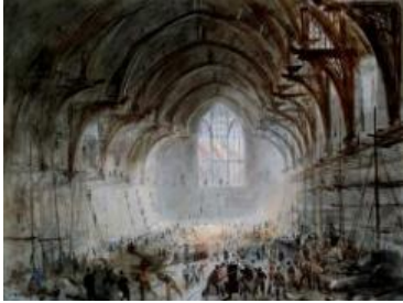
'Westminster Hall on Fire 1834' watercolour, by George B. Campion, 1834