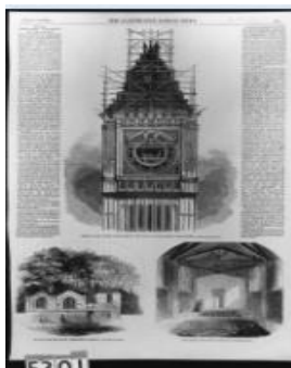
'Present State of the Clock Tower of the Palace of Parliament, Westminster [Illustrated London News] 1856' printing ink, by unknown artist, 1856 © Palace of Westminster Collection, WOA 5301 www.parliament.uk/art

For further information and images from the Parliamentary art and archives collections visit: