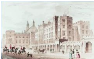
'House of Commons, House of Lords, As they were before the Fire, 16 th Oct 1834' printing ink, by John Shury, 1834 WOA 2566