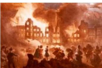
'Destruction of the Houses of Parliament 1834' colour lithograph, by F. Pickering © Palace of Westminster Collection, WOA 1170 www.parliament.uk/art