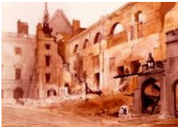
'House of Lords from Old Palace Yard, 1834' watercolour, by Robert William Billings © Palace of Westminster Collection, WOA 1660 www.parliament.uk