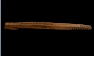
Medieval Tally Stick, Parliamentary Archives, HL/PO/RO/1/195