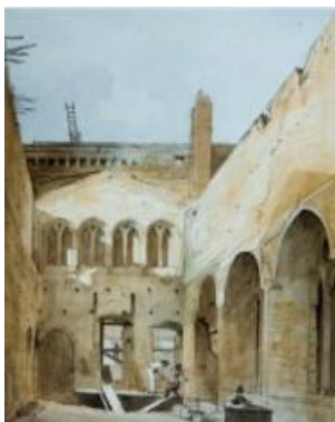
'The Painted Chamber, looking into the House of Lords, 1834' watercolour, by Robert William Billings © Palace of Westminster Collection, WOA 1666 www.parliament.uk/art