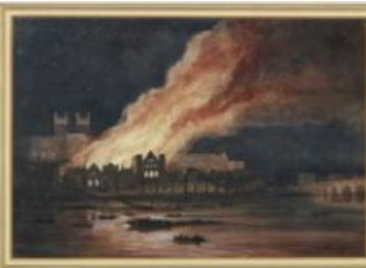
'The Palace of Westminster on Fire, 16 th October 1834' watercolour, by William Grieve, 1834 © Palace of Westminster Collection, WOA 1054 www.parliament.uk/art