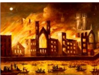
'Palace of Westminster on Fire 1834' oil painting, by unknown artist