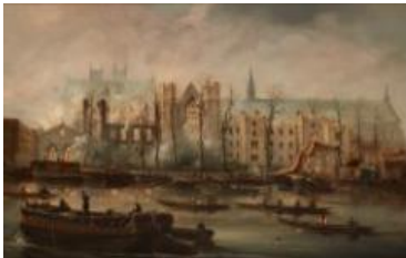
'Burning of the Houses of Parliament, 16 th October 1834' oil painting, by David Roberts, 1834 © Palace of Westminster Collection, WOA 2806 www.parliament.uk/art