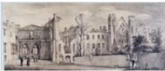
'View of the Houses of Parliament after the Fire 1834' printing ink, by Vacher & Son, 1834 © Palace of Westminster Collection, WOA 4648b www.parliament.uk/art