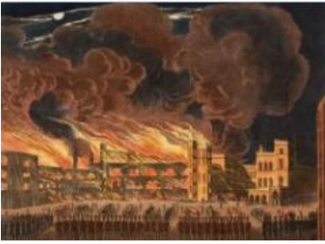
'The Fire of the House of Lords & Commons on Thursday Oct 16, 1834' printing ink, by unknown artist © Palace of Westminster Collection, WOA 1668 www.parliament.uk/art