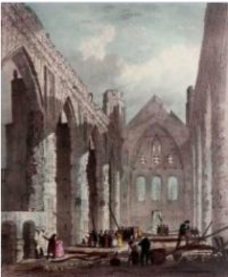
'The view of the Ruins of St. Stephen's Chapel After its destruction by Fire on 16 th October 1834' printing ink, by Day & Haghe © Palace of Westminster Collection, WOA 1594 www.parliament.uk/art

Unless otherwise stated all images are subject to Parliamentary Copyright©