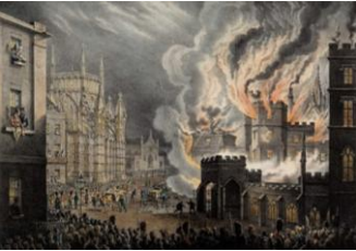
'The Destruction of the Houses of Lords and Commons by Fire on the 16 th Oct. 1834' colour lithograph, by William Heath, 1834