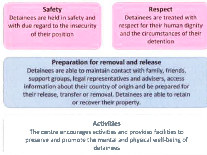
Fig 2 Brook House Vision

This plan aims to ensure Brook House meets the HMIP's standards of a healthy establishment: